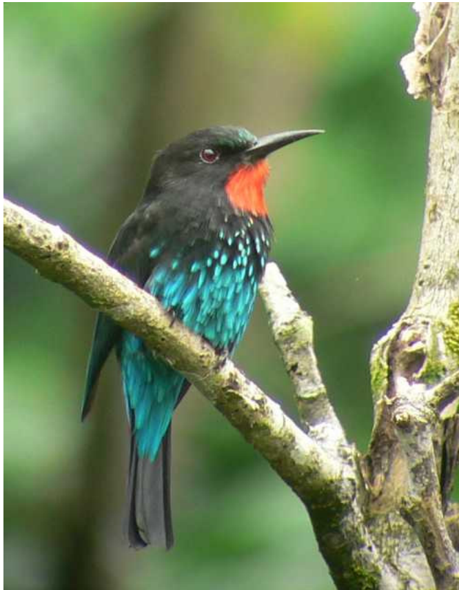
Black Bee-eater