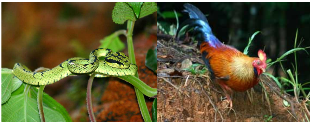
Green Pit Viper and Sri Lanka Junglefowl