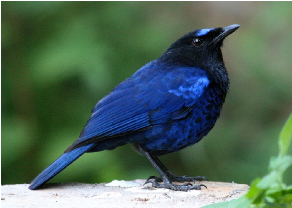
Malabar Whistling Thrush