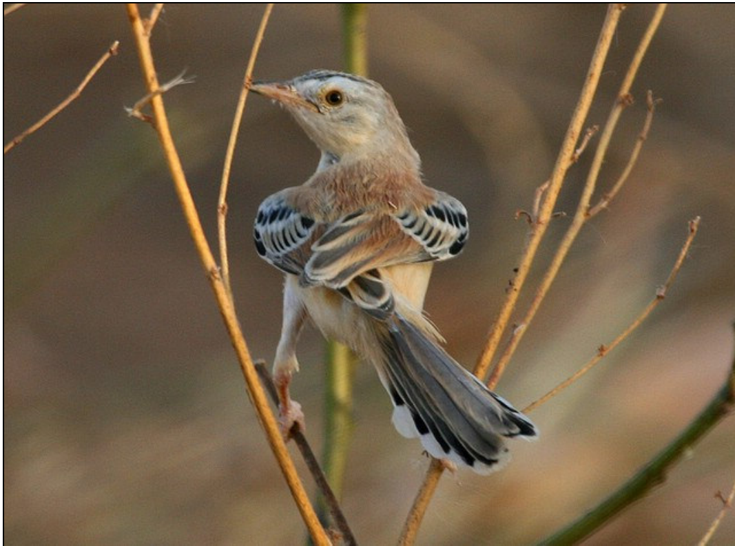
Cricket Warbler