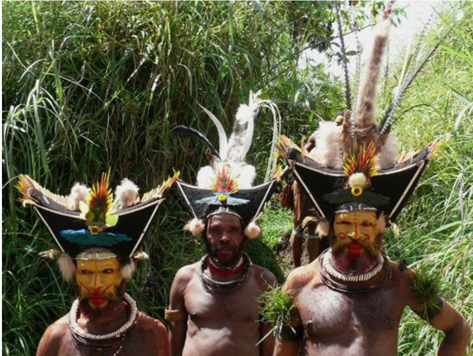
The Huli Wigmen we encountered near Ambua Lodge

Arriving at the luxurious Ambua Lodge, we were all impressed by the quality of the round thatched rooms complete with hydroelectric power and electric blankets for warmth, and with the view. Nestled at the edge of montane forest dominated by large old trees heavily adorned with dense epiphytes, the view of the surrounding valley was simply breathtaking. Indeed, Ambua Lodge has been ranked as one of the finest eco-lodges in the entire world. During our brief stay, even the hotel gardens were brimming with birds, and one fruiting tree adjacent to our cabins attracted no less than seven species of birds-of-paradise, including Black Sicklebill, Short-tailed Paradigala and the strange male Lawes Parotia. But for most of us, the undoubted highlight was the marvellous views we had of a gorgeous male Princess Stephanie's Astrapia displaying its spectacular tail plumes from prominent perches in the tree.