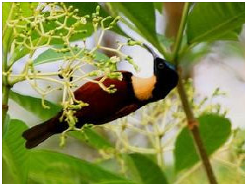
Buff-throated Sunbird